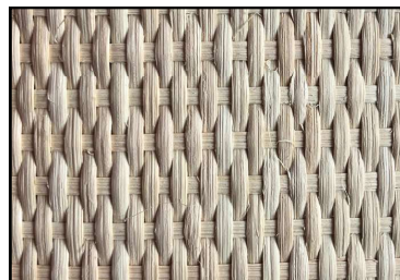
Basket Weave #1204