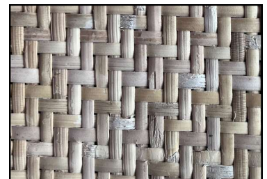
Herringbone Weave #1203

Rattan must be soaked and stretched prior to installation. Soaking, stretching and trimming Rattan can be a tedious process. DOD recommends taking advantage of their Cut-to-Size (CTS) Program, where Rattan panels are ready to install upon delivery without the need to soak and stretch on-site.