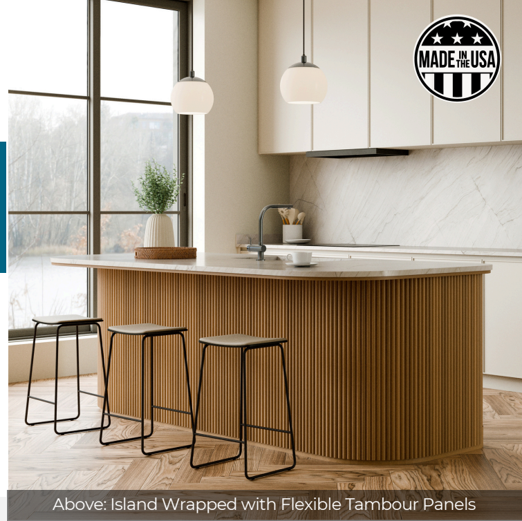
Above: Island Wrapped with Flexible Tambour Panels

Since 1998, Designs of Distinction® has provided finely crafted components and materials to businesses serving both residential and commercial markets. We lead the industry in new product development by reimagining today's trends into products that work for residential and commercial design. Cut-to-Size Materials, proprietary manufacturing and customized purchasing programs are hallmarks of the Designs of Distinction® brand.